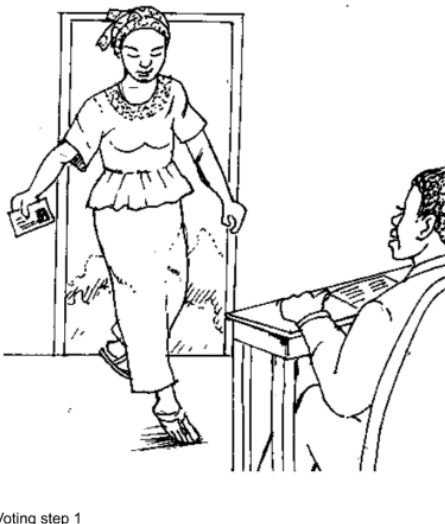
Ref. Voting step 1

Note: If the person does not have a valid identification card receipt to identify him/herself, the official will politely ask the voter to go and collect one.