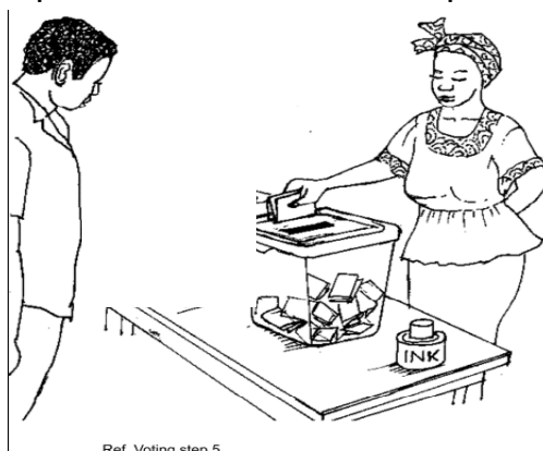
Ref. Voting step 5

Note: If the voter folds the ballot in such a way that the stamp is not visible, ask the voter to refold it so the stamp can be seen.