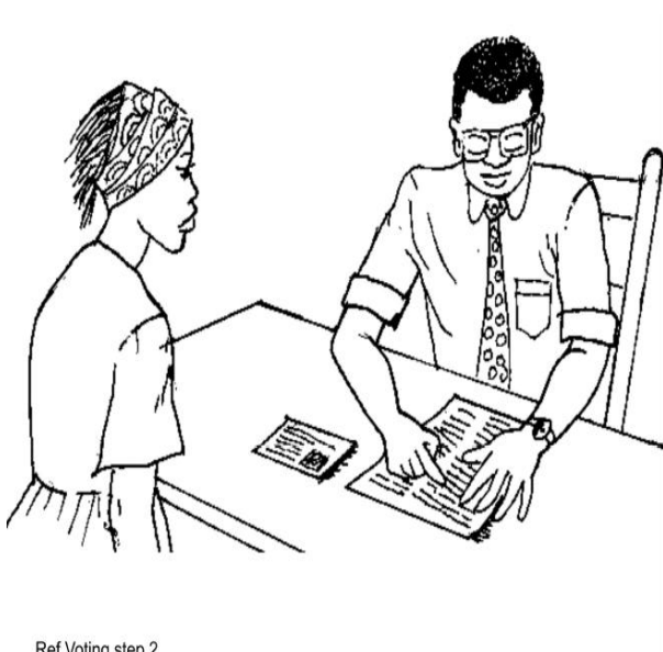
Ref Voting step 2